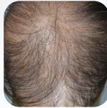
Diffused Hair Thinning