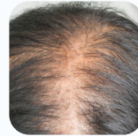
Improving Hair Density/Thickness

TRIGGER HAIR GROWTH & REGAIN YOUR CONFIDENCE WITH THE BROW & BEAUTY BOUTIQUE'S PROVEN HAIR REGROWTH MICRONEEDLING