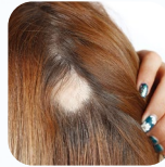
Patchy hair loss Alopecia Areata