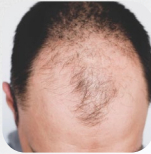
Male / Female Pattern Balding